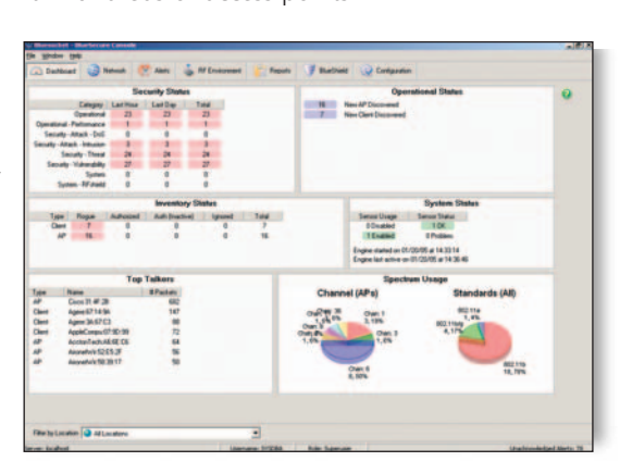
View real-time updates of security and operational status, and performance exceptions. Determine how your WLAN (spectrum, channels) is being used, where security holes are, and when intruders are trying to access your WLAN.

BlueSecure IPS protects the enterprise from all types of roque devices including Access Points, roque clients, neighboring WLANs, peerto-peer (ad hoc) networks, and software APs as they appear. Not only can BlueSecure IPS alert you to potential WLAN threats, it can also actively contain or block threatening roque devices. By enabling BlueSecure IPS's powerful blocking capability, you